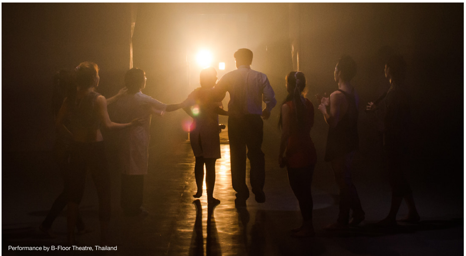
Performance by B-Floor Theatre, Thailand